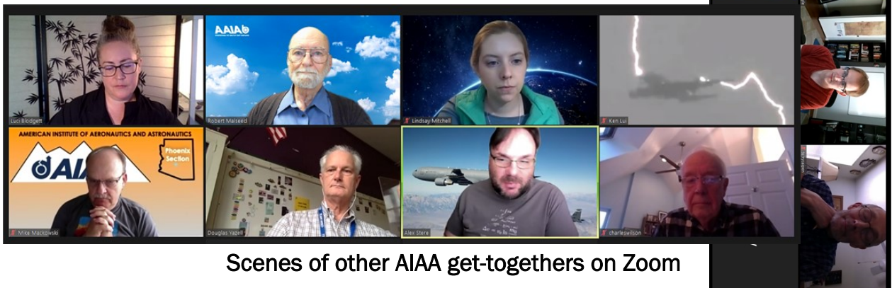
Scenes of other AIAA get-togethers on Zoom