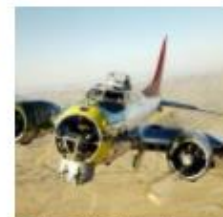
Boeing B-17 Flying Fortress "Miss Angela"+