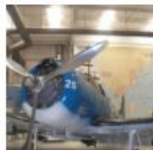
Douglas SBD Dauntless*