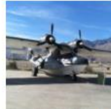
Consolidated PBV Catalina+