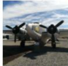
Lockheed PV-2 Harpoon+