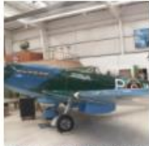
Supermarine Spitfire Mark XIV+