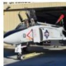
McDonnell Douglas F-4B Phantom II*