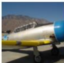
North American AT-6/SNJ Texan+