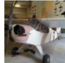
Piper J-3 Cub+