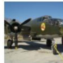
North American B-25 Mitchell Bomber+