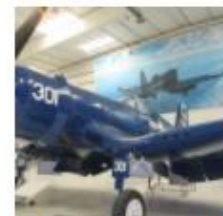
Chance Vought F4U/FG-1 Corsair+