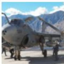
Northrup Grumman EA-6B Prowler*