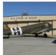
Douglas C-47/DC-3 Skytrain (Dakota)+