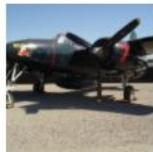
Grumman F7F Tigercat+