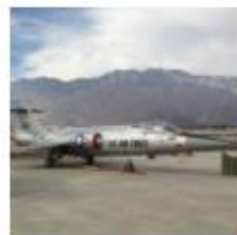
Lockheed F-104G Starfighter+