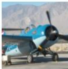
Grumman F4F Wildcat+

The museum has many aircraft on display. These are only a few of the many amazing aircraft: