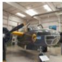
Douglas A26/JD1 (B26) Invader+