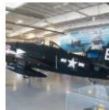
Grumman F8F Bearcat +