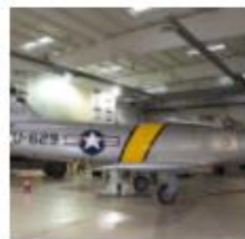
North American F-86 Sabre*