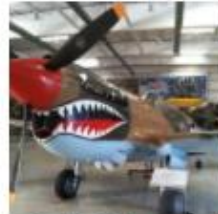
Curtiss P40 Warhawk+