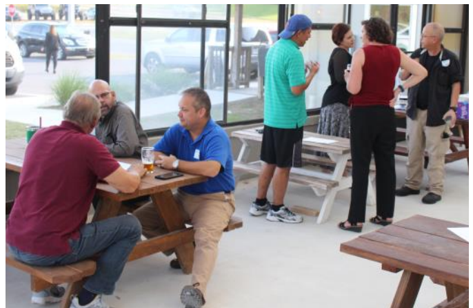
Members mingle and discuss during the event.