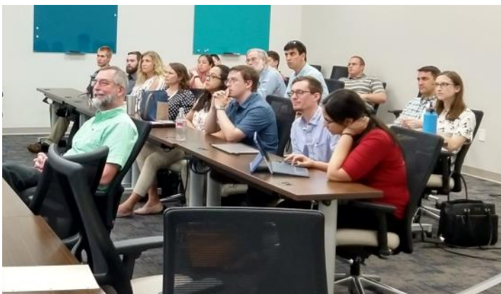
AIAA members and AFRL Scholars comprise an attentive crowd.