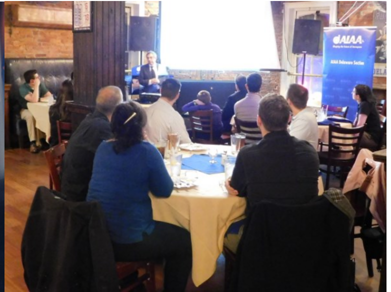
Distinguished Lecture Dinner at Klondike Kate's in Newark, DE