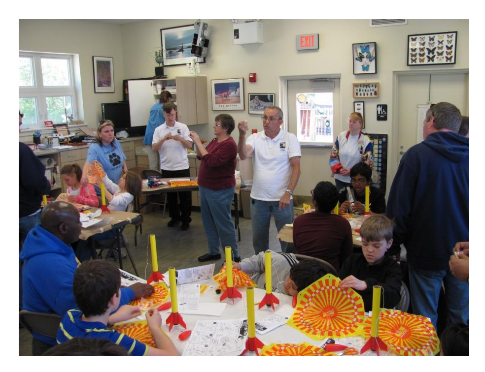
ALL THE PARTICIPANTS FOCUSING AND ENJOYING THE ROCKET ASSEMBLY