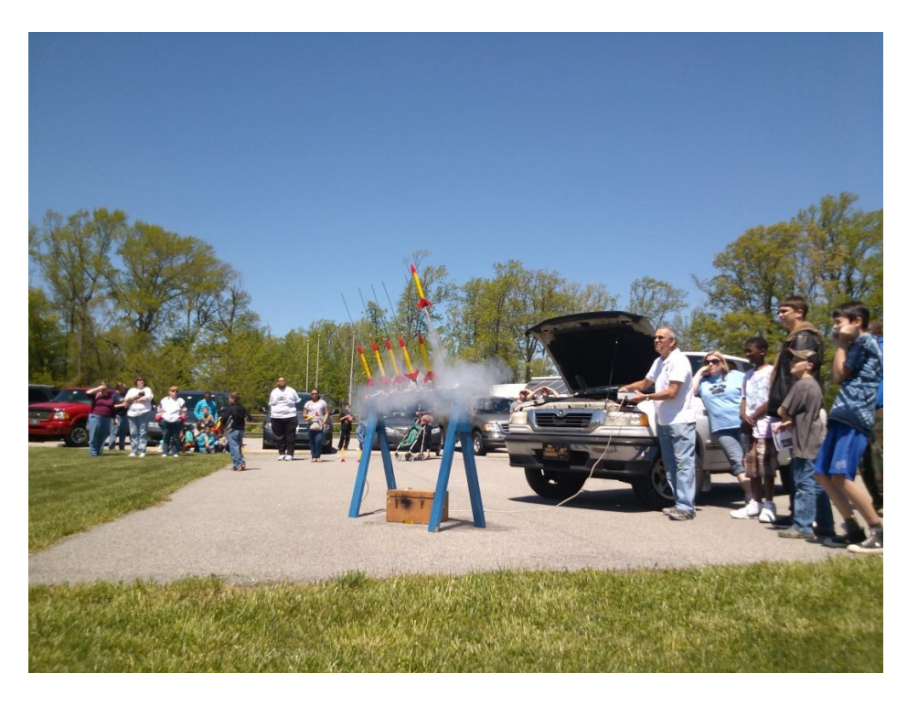
THREE, TWO, ONE, LAUNCH!